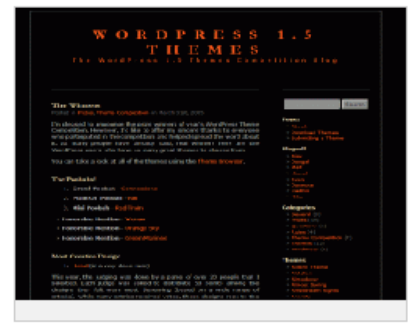
The dark side of white space.