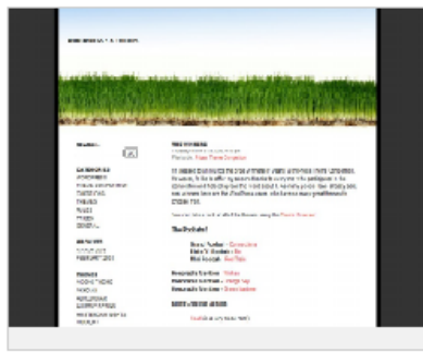
A two-column simplistic theme with an inclination to perform kind, charitable acts.