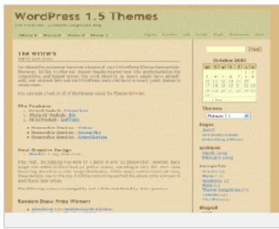
Quick, simple and classic.